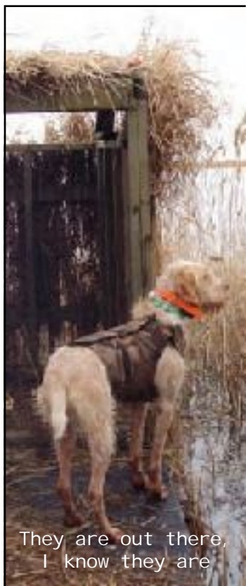
They are out there, I know they are